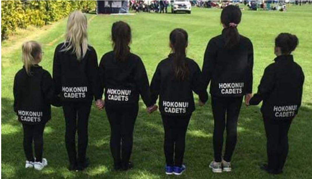
Hokonui Cadets – Southland