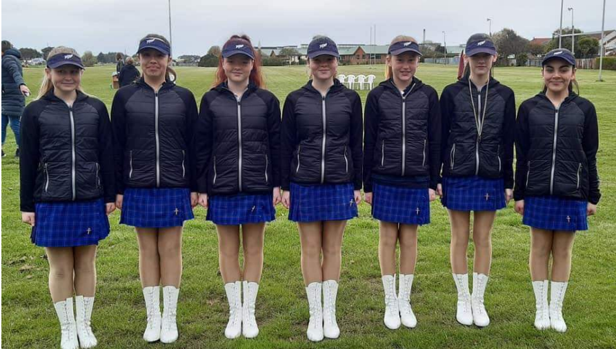
Blue Jay Under 16 - Southland