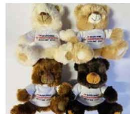
Blanket - Charm – Badges - Teddy Bears